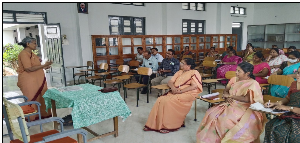
Principal and staff in the Programme